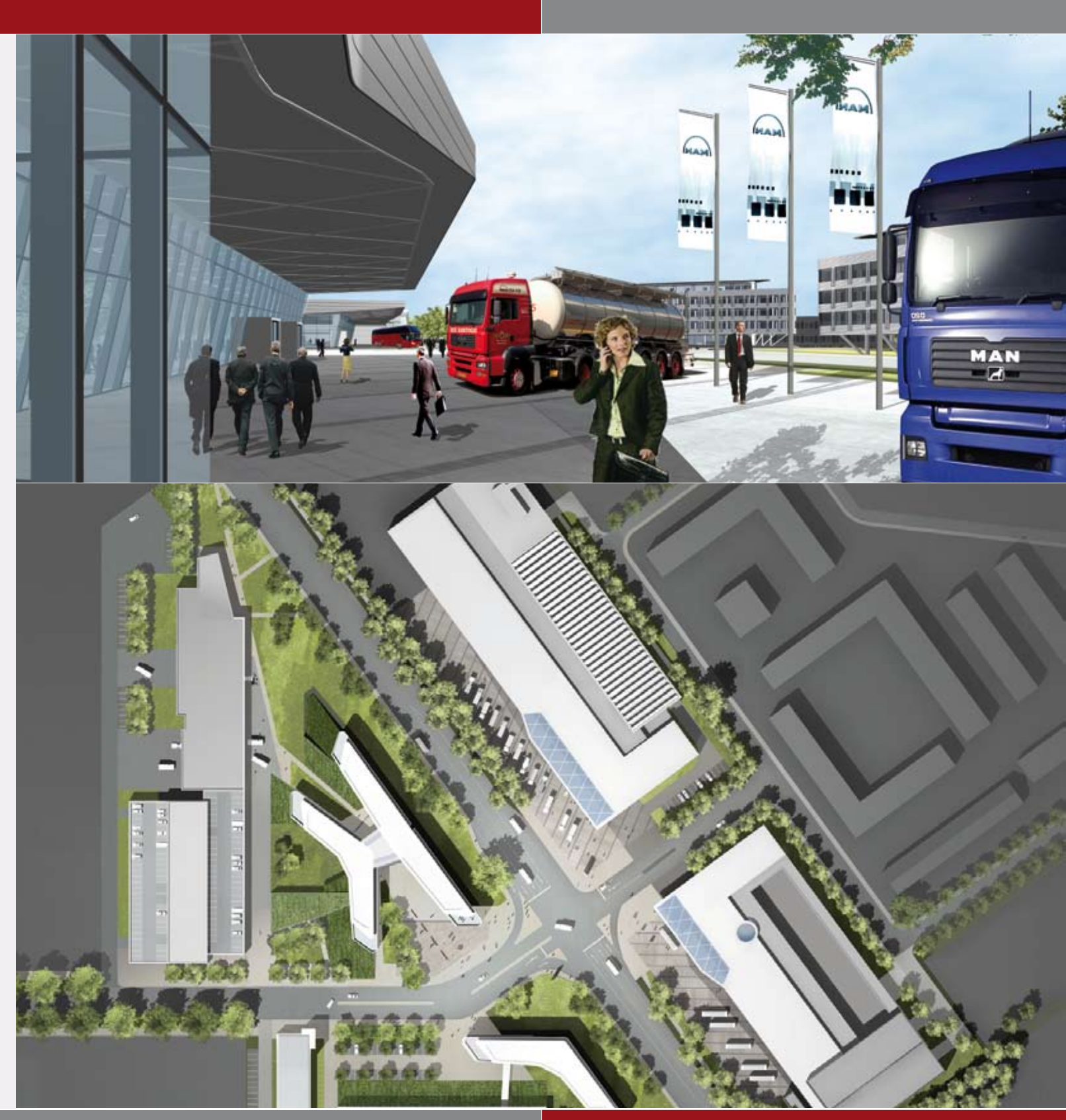
© Nemetschek Allplan GmbH, Munich, Germany, www.allplan.com

Carparks: Gross floor area: 30,840 m<sup>2</sup> Gross volume: 88,270 m<sup>3</sup> Parking spaces: approx. 1,200